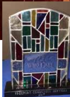
The 6 Who Care plaque.