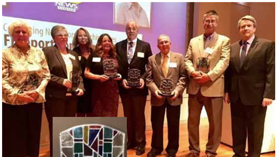
The 2017 6 Who Care Honorees.

Volunteer award winners were presented with a cash award to be donated to the charity of their choice. The Agency of Distinction award was a $2,000 contribution to the organization. WCSH6 has created a video presentation on each winner which will be broadcast on November 26th at 11:30 am.