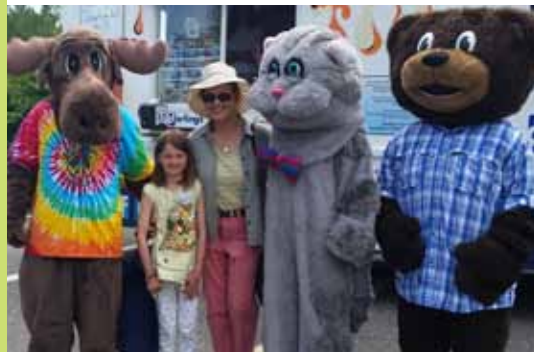
Meeting so many area mascots was a highlight of the day.

The following groups participated with us this year: YMCA, Freeport Fire & Police Departments, Freeport Elders, Freeport Community Library, Midcoast FCU, Arts & Cultural Alliance of Freeport, Midnight Prism Collective, who did great face painting, and RSU 5 Community Programs. It was a great opportunity for everyone on to meet and learn about a variety of programs.