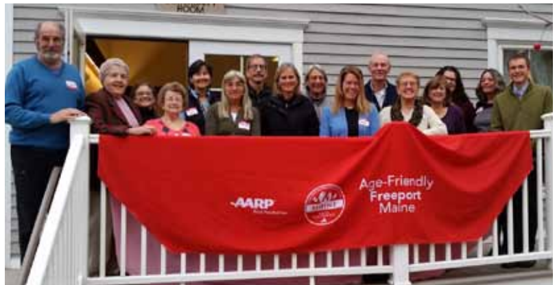
The FCS Aging in Place Steering Committee.