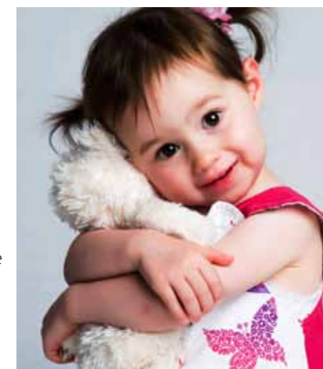
The Holiday Helpline program provides smiles as well as gifts!