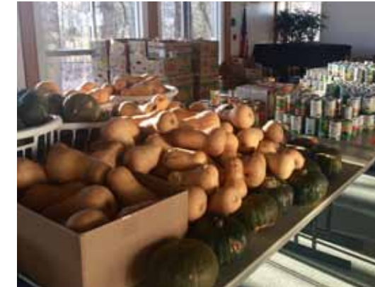
Food is ready for packing into Thanksgiving dinner boxes

Last year FCS provided 400 children and adults with food and gifts during the holidays. We expect as many, or more this year through our Holiday Helpline.