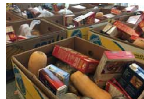
Food boxes ready for distribution.

Please help our community by supporting FCS and making a special gift this year of $50, $100, or more if possible. You may use the enclosed envelope or make a payment online via PayPal by going to fcsmaine.org and "Donate" at the top of the page. Your gift really does matter. Thank you.