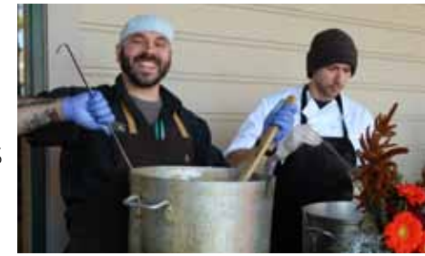
The Harraseeket Inn dishes up some chowdah.

We offered something different for dessert this year with homemade apple crisp from apples donated by Thompson's Orchards of New Gloucester and an a la mode version topped with Ben & Jerry's vanilla ice cream along with coffee and tea donated by Starbucks. Poland Spring donated bottled water.