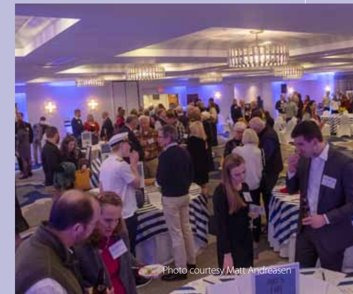
White Nights 2019 was another huge success.