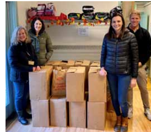
The LL Bean crew with their amazing fall food donation.