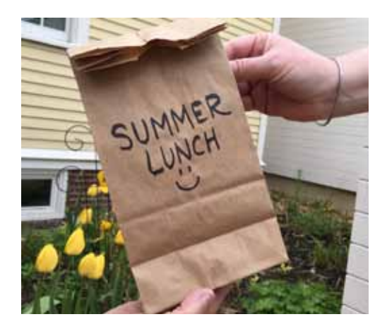
The free summer lunch program.

As the seasons change from winter to spring, and eventually spring to summer, many of our programs change as well. We are gearing up for some fun summertime offerings here at FCS and we hope you may find one that sparks your interest!