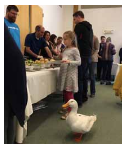
Therapy duck Snowflake wants lunch too.

treated volunteers with a delicious luncheon – and once again, employees of Kohl's and Old Navy volunteered their time to serve our honored guests. Goodie bags full of treats, gifted by our retail friends – and a raffle of multiple fun surprises – added excitement to the festivities.