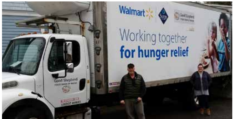
Good Shepherd Food Bank makes a delivery to FCS

FCS is very grateful to our business partners who have played a vital role in providing the food that we distribute to our neighbors in need. Some long-time partners include Hannaford, Shaw's, Bow Street Market, Royal River Natural Foods, and Good Shepherd Food Bank.