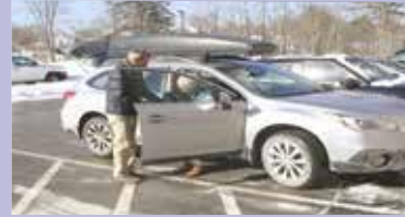
Our Volunteer Drivers provide a great community service

Volunteers play a vital role and FCS is looking for caring, compassionate volunteers to help carry out the organization's mission. Becoming a volunteer driver will help FCS continue to serve those in our community who need this growing essential service. And, volunteers like you, benefit too, by giving back to your neighbors in the community. With the additional drivers, more rides can be provided to those needing assistance getting to medical and essential services appointments. FCS is looking to expand as we recognize that many residents in Freeport and Pownal find transportation an ongoing challenge.