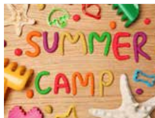
Summer Camp is always special