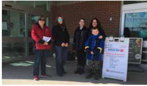
First year joining us. Atlantic FCU business team

Held on Saturday, Feb. 22nd, the objective of Freeze Out is, of course, fundraising and awareness of the struggles of those in need in our community and now, more than ever this support has helped us during the COVID-19 crisis we have experienced.