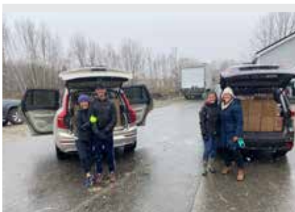
Volunteers pick up 4,000 pounds of food from Mid-Coast Hunger Prevention Program for FCS on April 28, 2020