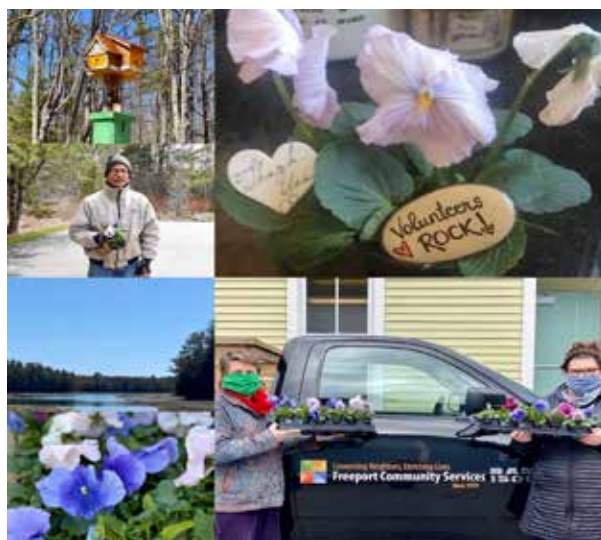
A wonderful day to recognize our volunteers