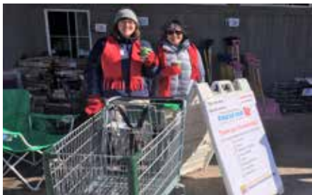
Freeport Community Library staff at Bow St Market

As a result, Freeze Out raised nearly $3,000 in monetary donations for our Fuel Assistance Program and 2,119 pounds of food/product for our Pantry.