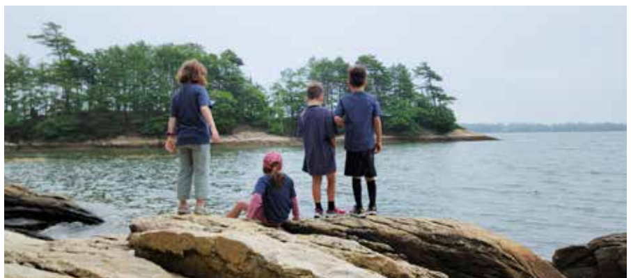
FCS HAS BEEN AWARDING CAMP SCHOLARSHIPS FOR NEARLY 50 YEARS.